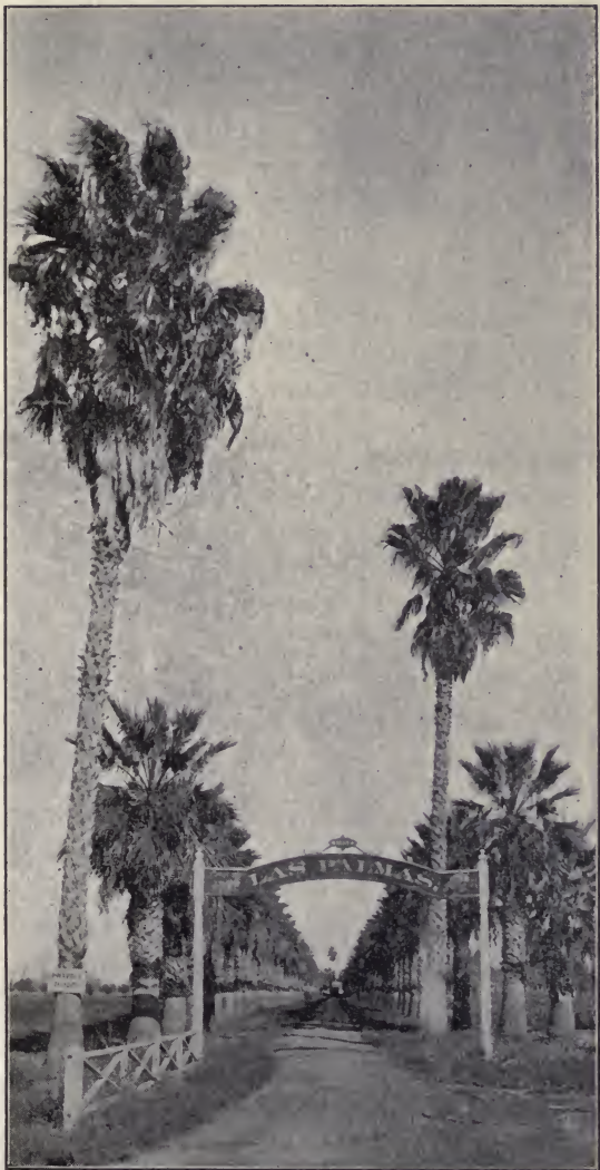
Fresno County, California, Palms